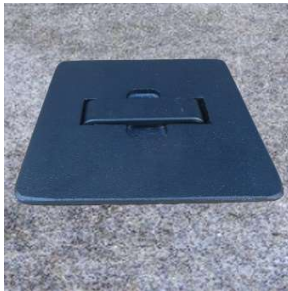
Shown in ground

(MK2 & MK3 - Drop Down Telescopic Lock Point)